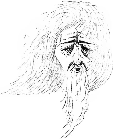
(RUDE IMPRESSION OF HARFAGER)

waved afloat from his bare and hirsute shins, and he was shod in those soft slippers called rivlins .